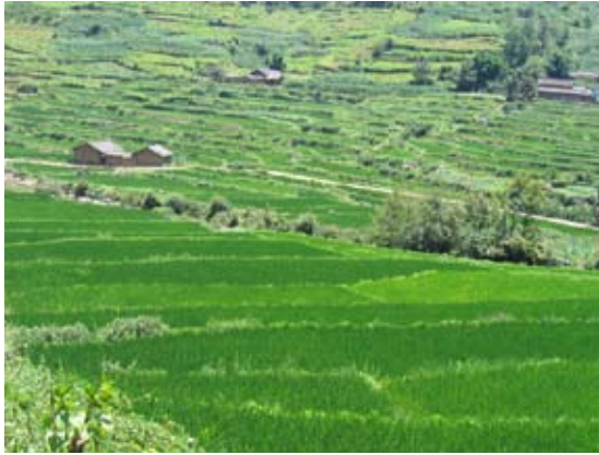
FIGURE 5. Summer rice field in dzə 11 qu 11 .