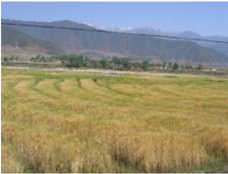
FIGURE 3. Autumn wheat field in dzə 11 qu 11 .