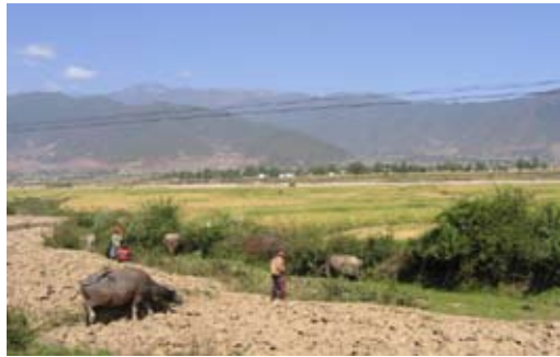
FIGURE 2. Children herd water buffalo in dzə 11 qu 11 .