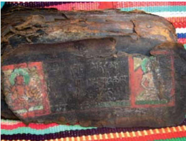
FIGURE 9. Old scripture owned by a family in dzə^{11} qu^{11} .