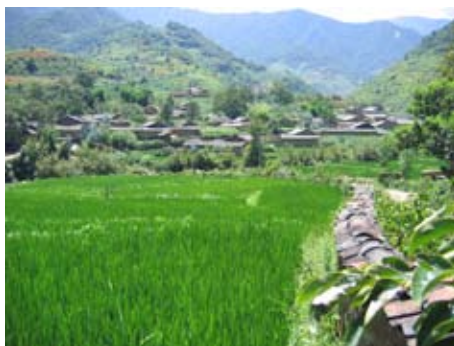
FIGURE 4. Summer rice field in dzə 11 qu 11 .