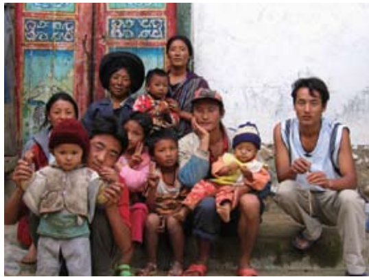
FIGURE 6. A Namuyi family in dzə 11 qu 11 .