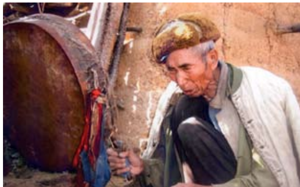
FIGURE 10. Mr. p^h a^{53} tsə^{53} ta^{11} ja^{11} (b. 1940) in dzə^{11} qu^{11} .