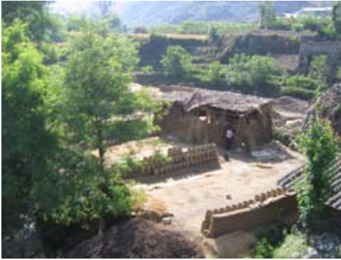
FIGURE 1. Tiles are made in dzə 11 qu 11 by a Namuyi family. After drying, these canisters are broken into four parts, stacked in a wood-fired kiln and baked. They are sold to local people.